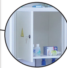
Chest for toxic products