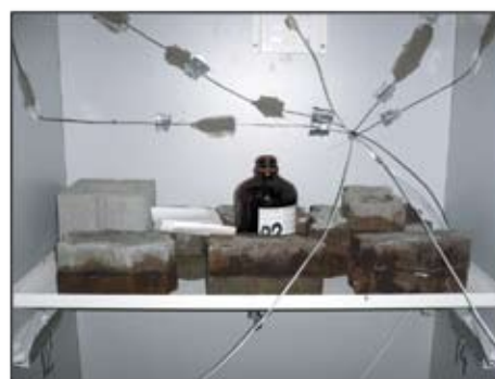
^Sensors in a flammable cabinet