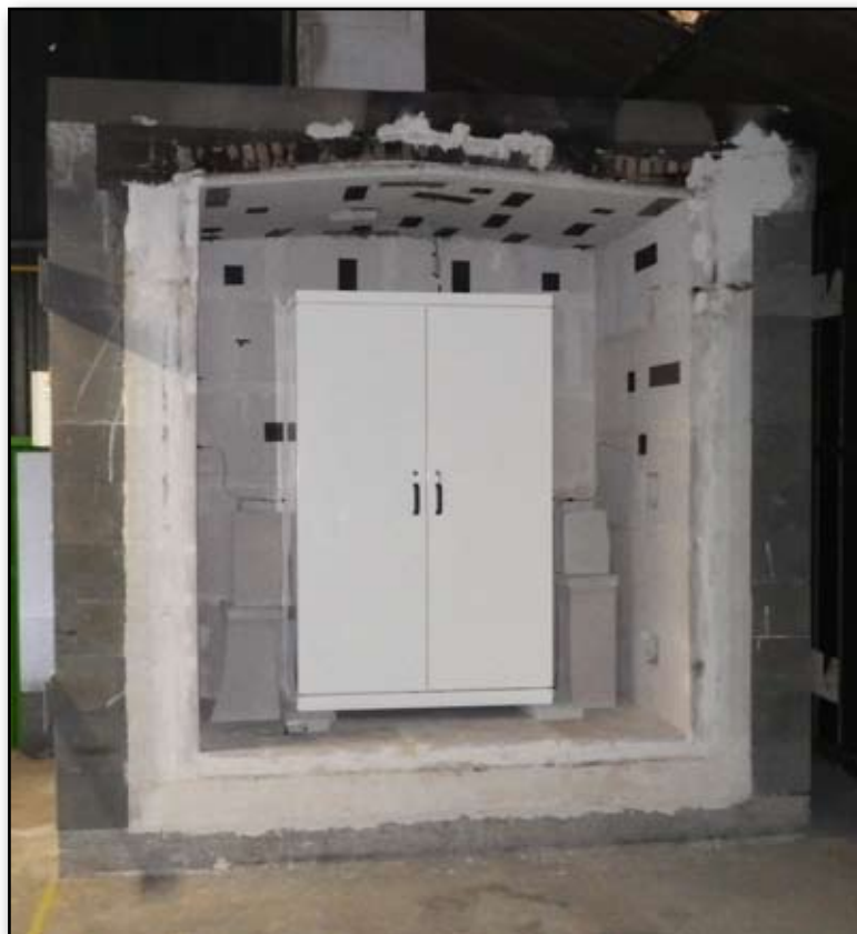
^795 cabinet placed into the oven to fire test according to EN 14470-1 norm (photography before test).