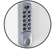
^ Option Code lock SERCODE (1 per door)