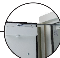
Self-closing door(s) with thermo-fuse