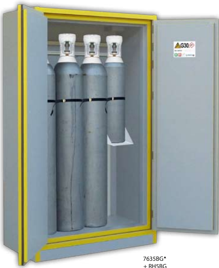
7635BG + + RH5BG + EG1