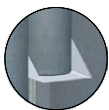
Shelf for one small gas cylinder - P/N EG1 (option)