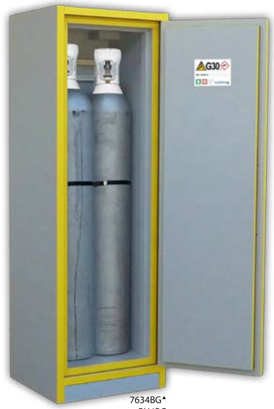
7634BG + + RH4BG