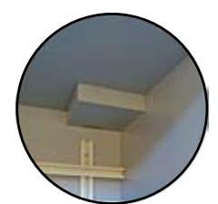
Vent with thermo-fuse

To protect the users health and to improve the life cycle of your safety cabinet, we recommend to install an exhausting system. Do not hesitate to contact-us for more information.