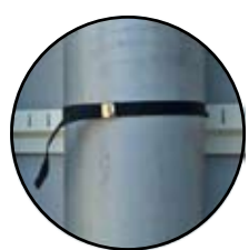
Mounting rails with tension belt - P/N RH4BG / RH5BG (option)